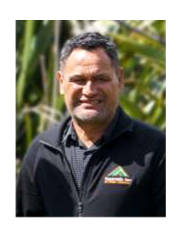
Wharehoka Wano Iwi