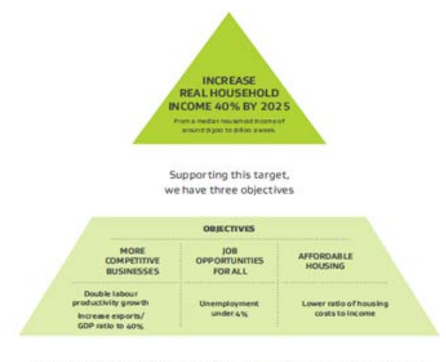
Figure 4: MBIE's purpose and objectives

To support the Government's priorities and our purpose we have identified five outcomes where the Ministry has the greatest opportunity to influence growth, and these shape what we do and how we invest our resources.