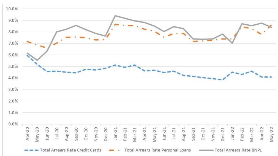
Figure 3: Total arrears rates by product type