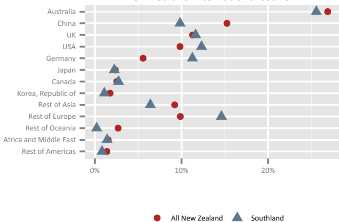
International tourist spend in Southland compared to all New Zealand international tourism