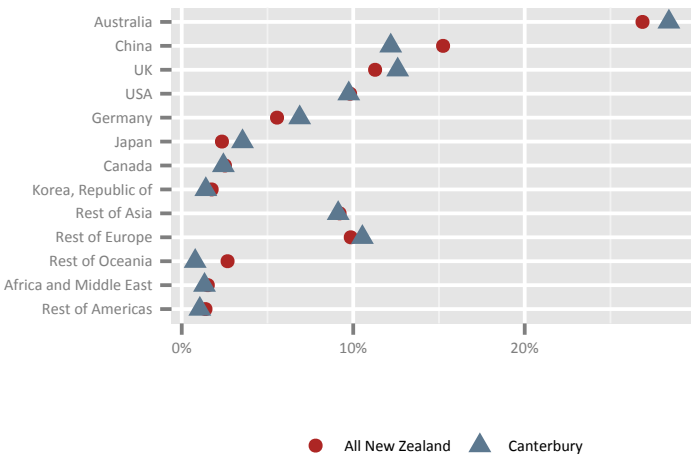
International tourist spend in Canterbury compared to all New Zealand international tourism