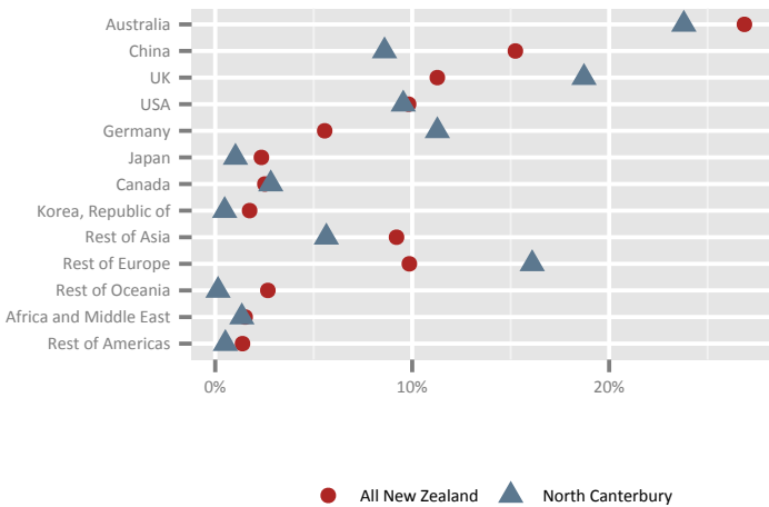
International tourist spend in North Canterbury compared to all New Zealand international tourism