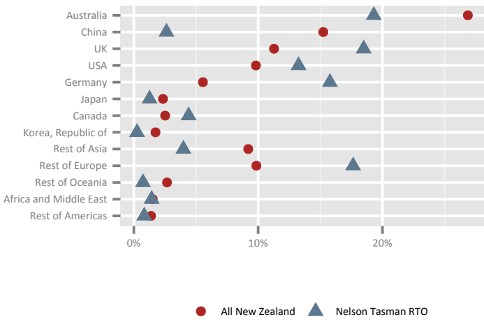
International tourist spend in Nelson Tasman RTO compared to all New Zealand international tourism