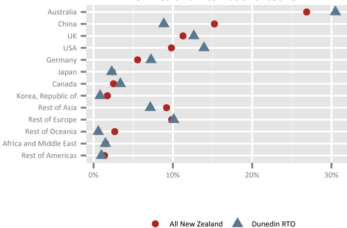
International tourist spend in Dunedin RTO compared to all New Zealand international tourism