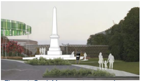
Figure 1: Cook Monument proposed

A new concrete plinth, landscaping and access path, around the base of the Cook Monument will be installed in order to provide a platform for storytelling and meeting place for visitor tours.