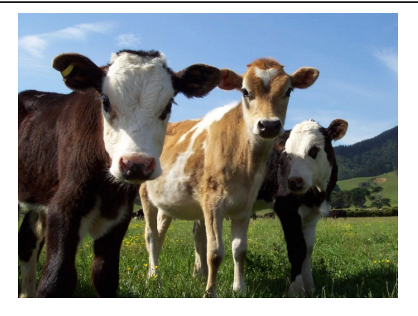
In 2011, New Zealand had around 4.8 million dairy cows, up from around 2.7 million in the early 1990s.