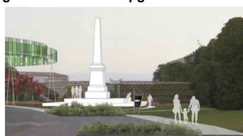
Figure 1: Cook Monument proposed

The Cook Landing Site Obelisk is a category 1 registered monument. Plans are to clean, restore and earthquake strengthen the obelisk.