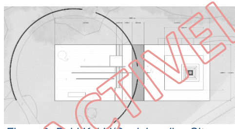
Figure 3: Puhi Kai iti/Cook Landing Site

As shown in figure 3, Puhi Kai Iti/Cook Landing Site will be a dynamic and interactive landscape.