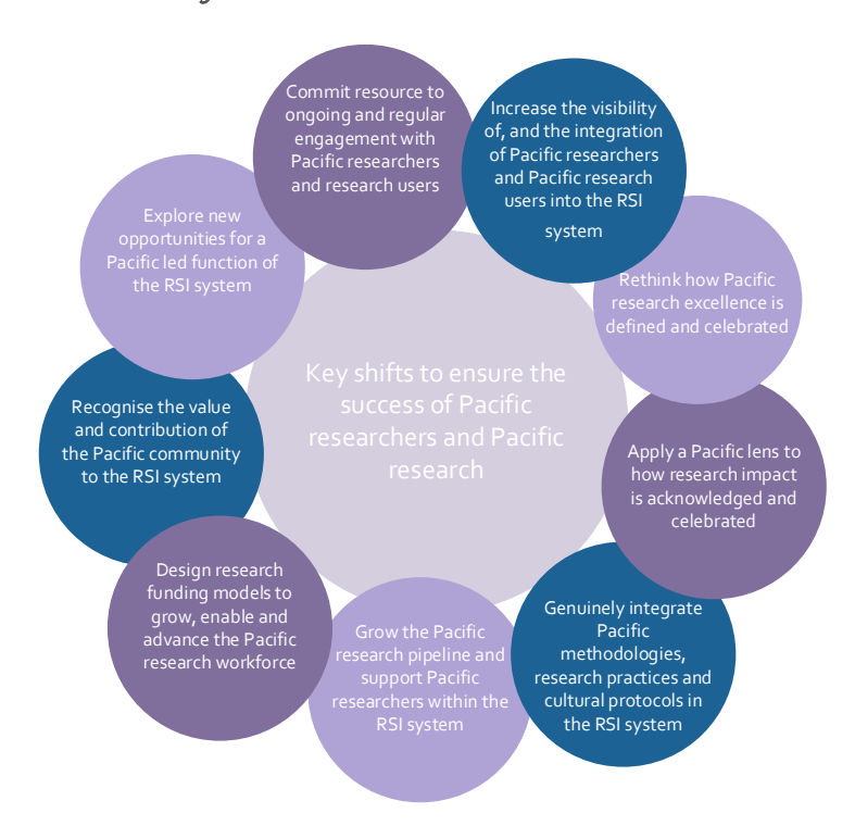
Figure 3: Key shifts to enable Pacific researchers and research excellence to thrive in the future RSI system

Figure 2 provides a visual representation of the nine key shifts identified across the consultation process. Each of these key shifts are described and substantiated with supporting solutions and opportunities below.