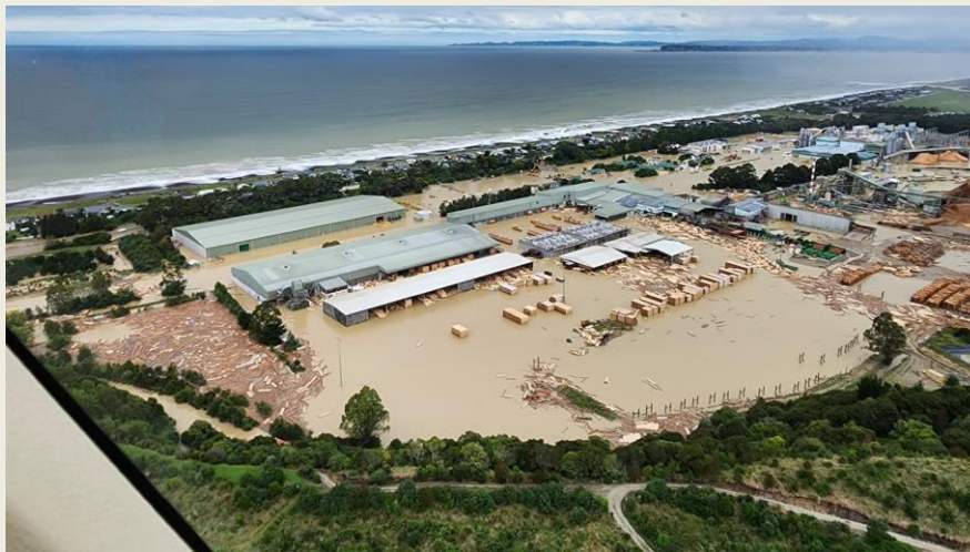
Figure 1: Pan Pac Whirinaki site the day after Cyclone Gabrielle