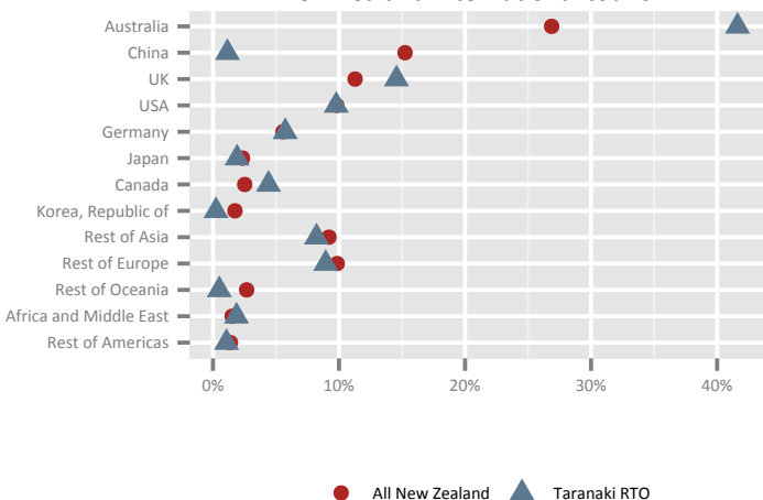
International tourist spend in Taranaki RTO compared to all New Zealand international tourism