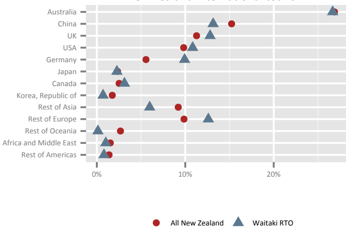
International tourist spend in Waitaki RTO compared to all New Zealand international tourism