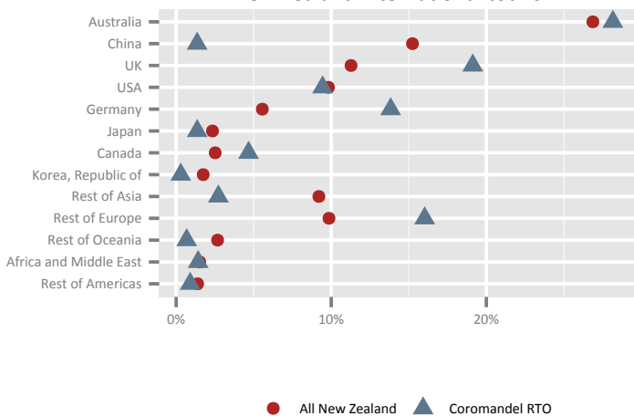
International tourist spend in Coromandel RTO compared to all New Zealand international tourism