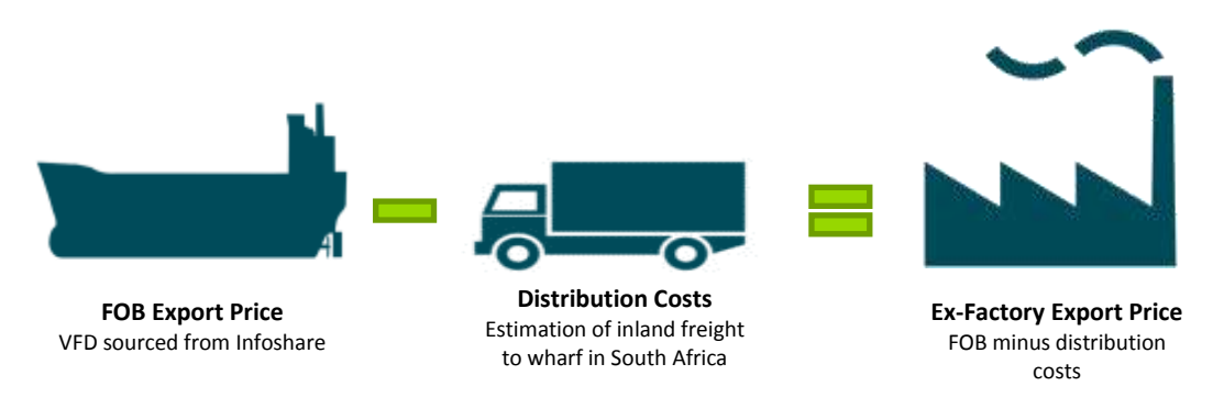
Illustration of HWL's calculation to ex-factory export price