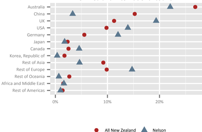
International tourist spend in Nelson compared to all New Zealand international tourism