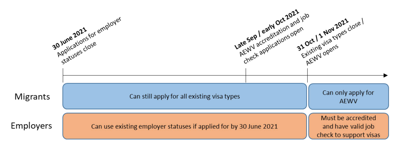
Figure Two: AEWV transition timeline, based on November 2021 implementation

5. This briefing sets out a new proposed timeline, following the decision to delay implementation.