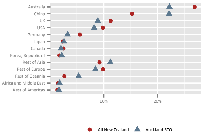
International tourist spend in Auckland RTO compared to all New Zealand international tourism